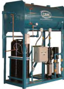
CBW Feedwater Tank

A compact feedwater system to take up less space by incorporating a water softener, feedwater pumps, control panel and hardness alarm into one system, ready to pipe into any system.